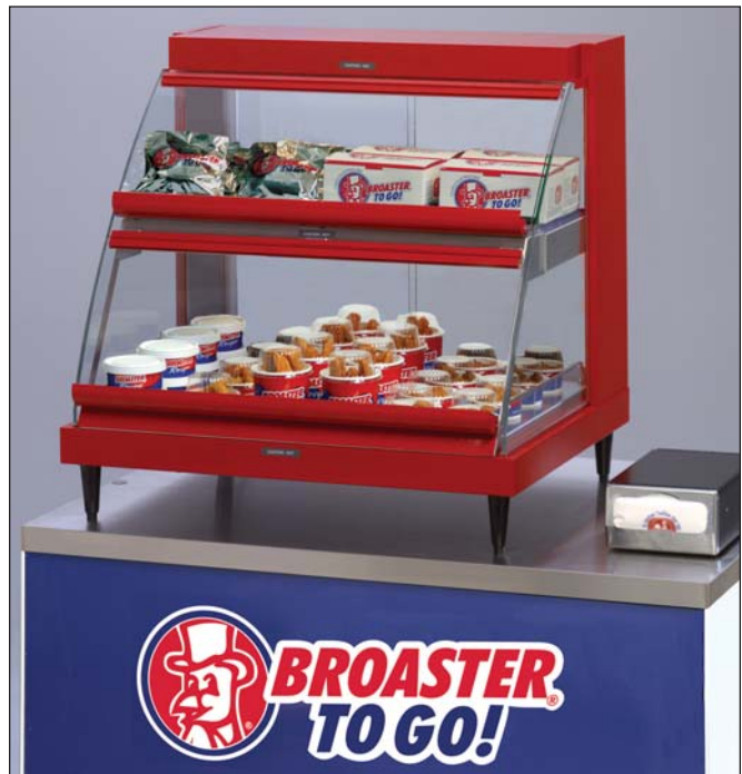
GRCD-2PD with optional red designer color and flip-up doors.