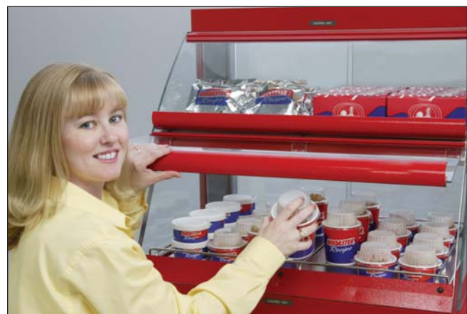
GRCD-2PD with optional red designer color and flip-up doors.