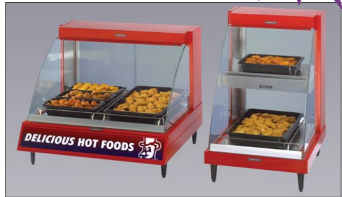
Left: GRCD-2P featuring optional red designer color, optional backlit base holder, and optional vinyl graphic transparency insert. Right: GRCD-1PD with optional red designer color.

* optional features are not retrofittable